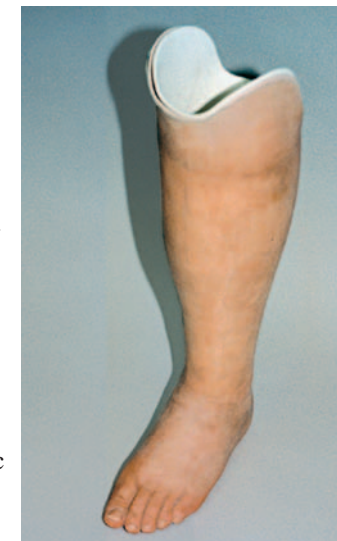
Finished prosthesis with detailed cosmesis applied