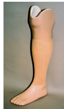
Endoskeletal form cover ready for finishing

• Detailing. Beyond the basic cosmetic treatment for a prosthetic limb—general shaping and pigmentation to match the residual limb—