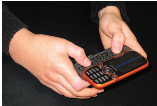
Cody demonstrates his preferred texting technique.

Although it is possible to text using the one finger "hunt and peck," today's accomplished practitioners of the art prefer the "flying thumbs" method of text