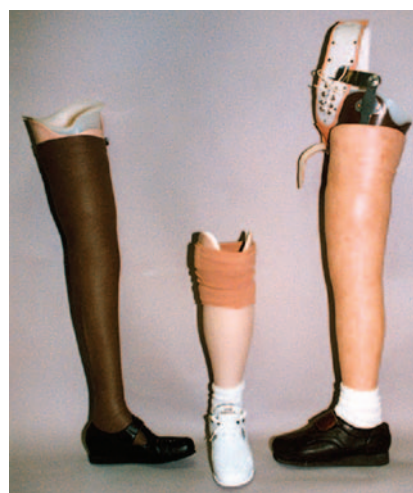
Prosthetic sleeves come in a variety of sizes colors and enhancements, such as the appearance of hair (at right).

The type and degree of cosmesis applied to a prosthetic limb are determined by several factors, including the desires, vocation and lifestyle of the amputee, cost and reimbursement resources, and the