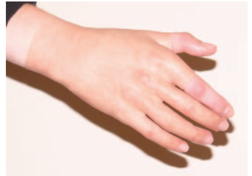
Glove close-up shows immaculate detail.